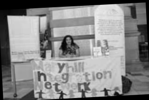
Maryhill Integration Network

During the course of the day there were also a Curator Tour, a 30 minute tour of the Glasgow Stories exhibitions, exploring our history of mental health care and R D Laing's legacy. Over 200 people took part in the workshops with at least the same amount experiencing the Fashion Show, dance, music and interactive stalls available to the public on the day.