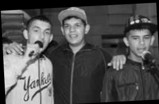
Young Roma Singers