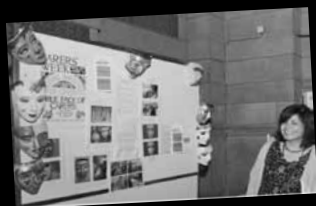
GAMH Interactive stall