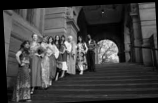
Maryhill Integration Network Fashion Show